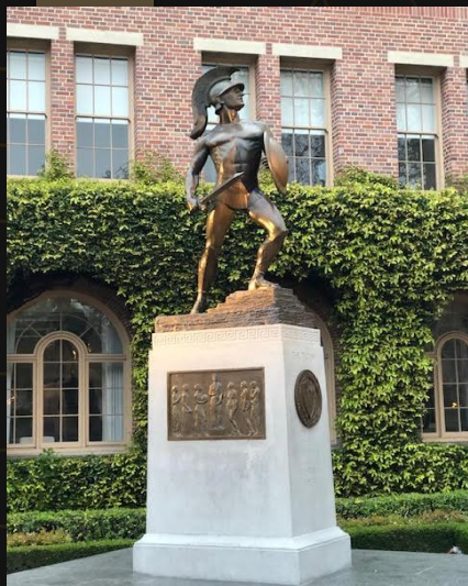
University of Southern California