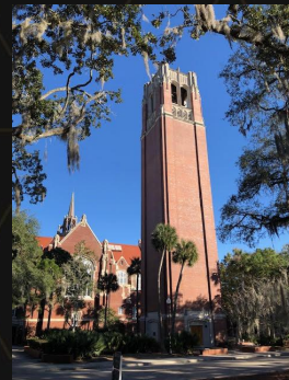
University of Florida