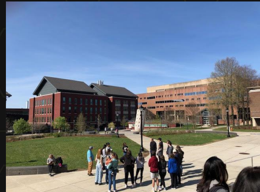
University of Connecticut